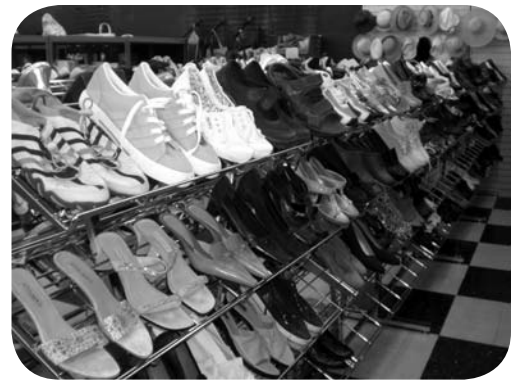
New shoe department has been re-organized and includes purses, hats, and other accessories.

The store is located at 3723 Brainerd Road and is open Monday-Saturday from 10 am to 6 pm and Sunday from 1 pm to 6 pm. If you have larger items that need to be picked up, the truck runs five days a week and can easily come to your house. Please call store manager, Cheryl Hooks , at 698-3730 to schedule a pick-up. Many thanks to all of the volunteers and donors who made 2010 a record year for the store!