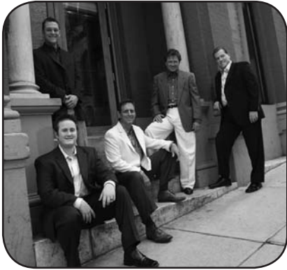
The LeFevre Quartet