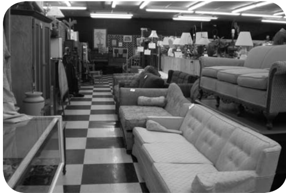
The store's furniture has been moved closer to the front of the store and has been spread out for easier viewing of all of the great items.

The Thrift Store staff used several of January's snow days to re-set parts of the store. The mini-makeover included an upgraded shoe department with new shoes racks, better accessibility to the furniture section, and a new layout, allowing more merchandise to be displayed in an organized manner. We receive compliments on this store all the time, so if you have never stopped by, please do so. We would love for you to come in and shop, volunteer, or donate items.