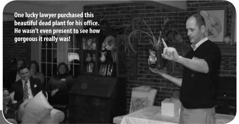
One lucky lawyer purchased this beautiful dead plant for his office. He wasn't even present to see how gorgeous it really was!