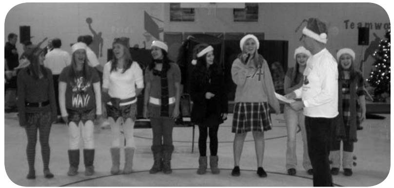
Collegedale Academy students lead the children in Christmas carols during their annual Bash.

The children who live in our foster homes and in the Chambliss Shelter are traditionally showered with gifts by the Hamilton Place Rotary Club . This group collects wish lists from every child and then spends countless hours purchasing gifts for them. They threw a great party with food, ice cream, music, and games for the children and teenagers in December. Thank you, Hamilton Place Rotary, for your generosity and compassion for our young people! You truly make their holiday special!