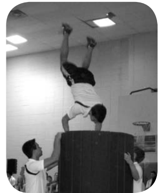
CA gymnasts show the children how they can jump over very large objects!