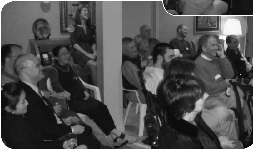
A room full of guests laugh at the descriptions and antics of our celebrity auctioneer.